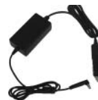
Vehicle Cigarette Adaptor Charger