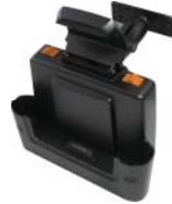
Vehicle Docking Station