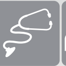
Mobile Physician Rounding