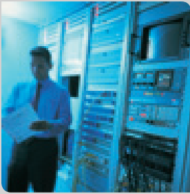
Field Force Automation