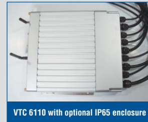
VTC 6110 with optional IP65 enclosure