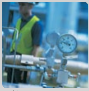
Field Force Automation